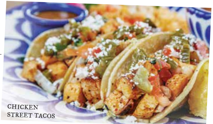
CHICKEN STREET TACOS