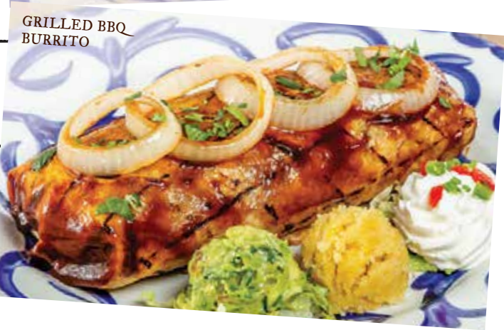
GRILLED BBQ BURRITO