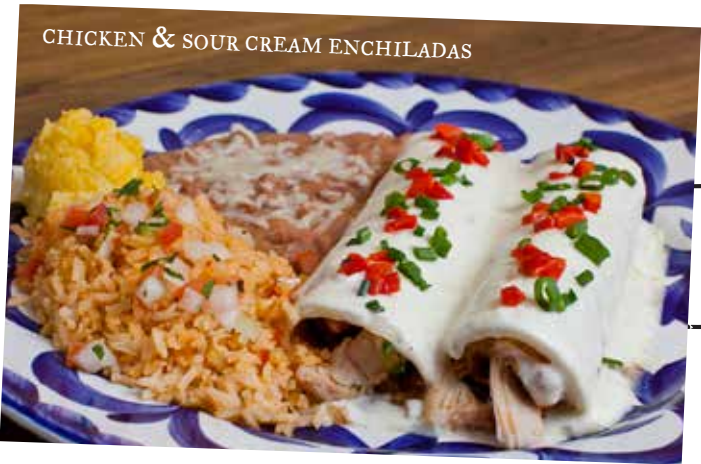
CHICKEN & SOUR CREAM ENCHILADAS